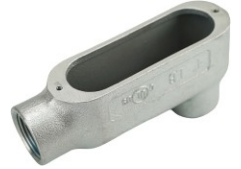
Table 1 - Dimensions of form 5 conduit body LB type