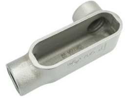
Tabel 1 - Dimensions of form 7 conduit body LR type